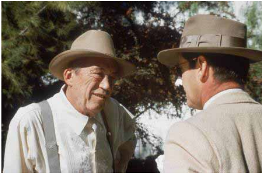
Figure 11 Noah Cross (John Huston) meets Jake

He is viewed as a master of black comedy, a satirist, a bitter and twisted individual – in fact his re-emergence with CHINATOWN was viewed with bemusement (and in some quarters bewilderment) since in the perversely Puritanical United States, the murder of his eight-months pregnant wife was seen as a byproduct of Polanski's own Satanic tendencies - he had, after all, directed ROSEMARY'S BABY (1968) and for Robert Evans, no less. Hence the general assumption that Polanski wielded the seniority on CHINATOWN, since it is a widely held view that there are two ways a writer can have his personal worldview expressed cinematically – through one single character (usually a secondary figure, who becomes the film's 'moral guiding voice' and of course, ironically, it is Cross who expresses the thematic subtext in CHINATOWN); and, through the ending: which, in the case of CHINATOWN the film, was definitely Polanski's.