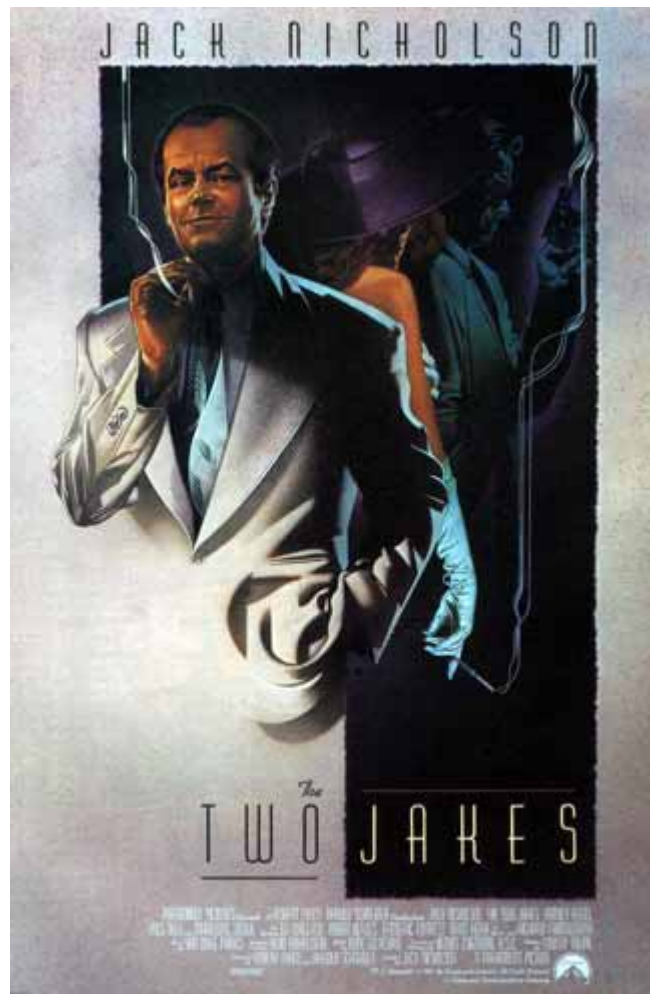
Figure 20 THE TWO JAKES poster

The screenplay starts similarly to CHINATOWN, and in fact bears many structural similarities to the second draft of that screenplay: a routine case of marital infidelity is tied up with a land grab – this time, for oil (hinted at by Evelyn’s fatal shooting of her father on an oilfield at the climax of the first draft); Gittes is hired by (what might as well be a fake) Jake Berman and is fooled by almost everyone he encounters, framed as an accessory to murder. The first draft has scenes in Mexico City, where Gittes attempts to find Katherine Mulwray and locates the orphanage where she was brought up before