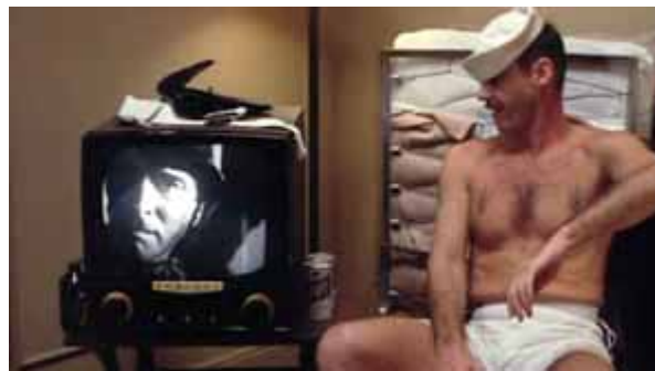
Figure 5 Bad Ass runs the whole show

"Now that movies were opening up, this was an opportunity to write navy guys like they really talked. The head of the studio sat me down and said, 'Bob, wouldn't twenty 'motherfuckers' be more effective than forty 'motherfuckers'?' I said, 'No.' This is the way people talk when they're powerless to act; they bitch.' Towne refused to change a comma, and Nicholson backed him up." 78