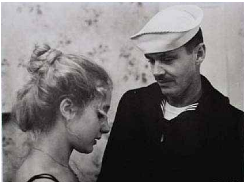
Figure 6 Bad Ass bargains with the whore (Carol Kane)

Some of the biggest films in 1973 (the film was released in December) could be similarly classed as Buddy movies, with a twist: SERPICO , THE STING , THE THREE MUSKETEERS and AMERICAN GRAFFITI . It might be argued however that none of these films (with the exception of GRAFFITI ) demonstrated such a lightness of touch that they could bring up complex social issues and resolve them within the neat exchanges of dialogue that characterises THE LAST DETAIL .