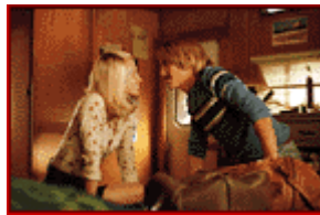
Figure 33 Mary Marckx (Monica Potter) with Pre

This is the beginning of an extended sequence delineating their relationship in parallel with that of Steve and Bowerman – in the same way that Bowerman and Steve are educating each other in terms of each other's respective philosophies, Mary and Steve teach each other also – as his attempts to make her fit into his life (and shoes) indicate, and her resistance provides the dynamism that is the pre-requisite for their love affair.