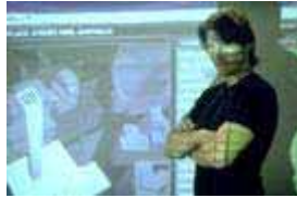
Figure 29 Ethan Hunt (Tom Cruise) instructs his team

Towne, told of De Palma's explanation, chuckles. "That's fine with me," he says. "It was a little more complicated than that, but what the hell. I went out and worked on his ending and kept some of the things I had. It was actually the same thing that happened with CHINATOWN." Cruise, being the man of the house as usual, was the liaison between the two. 76