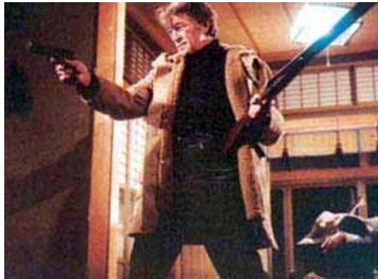
Figure 18 Kilmer's final shootout

that. I tried to make it more plausible. 13