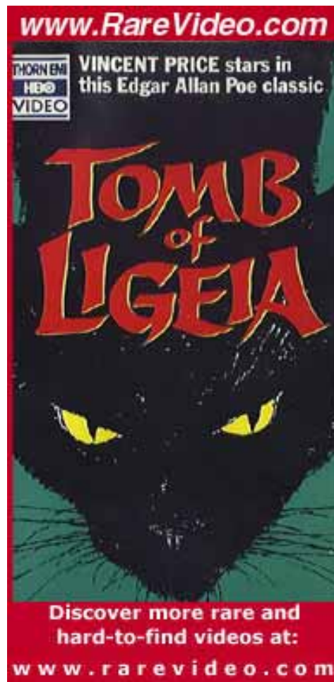
Figure 2 Cover of THE TOMB OF LIGEIA VHS

Therefore we can see another aspect of Towne's emergent trademark as screenwriter: realism, or at least authenticity, to the extent that this can be expressed in a generic format whose visual strategies were virtually predetermined by the series' true auteur, Roger Corman. On a purely narrative level Towne was now mature enough as a writer to use the original text as propulsion to truly express something else in the screenplay. In other words, he was beginning to find his voice. He has commented of his approach: