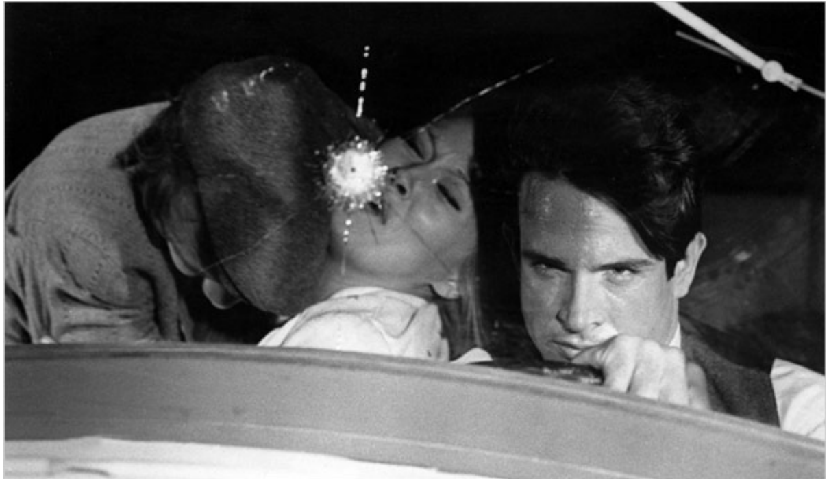
Figure 4 Escaping the law

copy provided by Beatty himself Newsweek recanted their original review and lauded the film as the harbinger of a New Cinema.