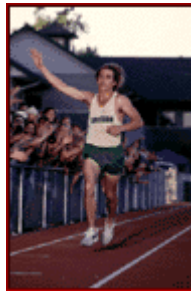
Figure 30 Pre (Billy Crudup) acknowledges the fans

wish for immortality. In their own way, the subjects of biographical films (by their actions, achievements, character) have achieved immortality.” 84