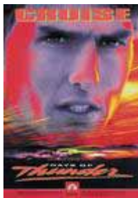
Figure 125 DAYS OF THUNDER poster art

had been when previously paired with director Tony Scott in TOP GUN – on a motorcycle, reeking of gritty rebellion and steadfastness. In fact, for a spell, the film was being called TOP CAR. In Bruckheimer’s mind, Towne was “the godfather of verisimilitude. If the script called for a bloodhound, and [DAYS OF THUNDER director] Tony Scott brought out a dog that wasn’t a bloodhound, Robert went nuts. He’s a stickler.” 23