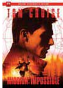
Figure 28 MISSION: IMPOSSIBLE dvd cover art

The entire film is littered with animal references – from the restaurant meeting at Aquarium (Akvarium) (rejoining Towne's fondness for water motifs) with Kittridge (Henry Czerny); Ethan runs up a spiral staircase, which, photographed from above, looks like a seashell; to the idea of the disavowed Ethan as the mole (he literally burrows his way back into Langley – he has to be a mole to find the mole); and Ethan as prey – dangling like a fly into the spiderweb vault at CIA headquarters. 65 Krieger's giveaway Judas sneeze is occasioned by the intrusion of a rat into the tunnel – thus putting the analogical symbol and the actual referent into the one shot so that we don't miss the crucial information – Krieger is the rat... The symbolism is absolutely clear throughout the dazzlingly constructed setpieces. Important threshold scenes take place on a bridge in Kiev – just as they did in Towne's Man From U.N.C.L.E. episode; similarly the masquerade of diplomacy at the reception held at the American Embassy; and the