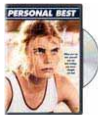
Figure 19 PERSONAL BEST dvd cover art

The story might have been prompted by a chance meeting with athlete Jane Frederick in the weight room at UCLA in 1976. Biskind makes the claim for it that “it was still another story about innocence despoiled, primitive grace, pre- or sub-verbal natural man, or in this case, woman.” 32 The film is unique in its two female leads (perhaps only THE TURNING POINT , 1977, could boast a similar contemporary story of female rivalry and love/hate); in its utilising of the mythological (even fairytale) as narrative arc; and in its eliciting of an extended response among queer film theorists.