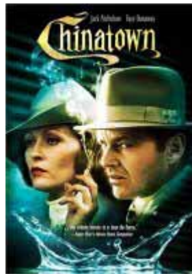
Figure 7 CHINATOWN one sheet

Principally utilising the filter of genre construction, the following section examines aspects of the three drafts of the screenplay. 15