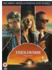
Figure 24 TEQUILA SUNRISE poster art

Jo Ann, however, is much feistier and probably cleverer than any of Hawks' heroines and her wordplay is on a par with anyone conceived by Towne for the screen. If we view Jo Ann's role in relation to Nick, we see that her capacity as agent for change is enhanced, which then leads to the conclusion that we are dealing with a split protagonist: Mac and Nick – who are literally split apart since Mac befriended Carlos, after the drug bust in Mexico all those years ago – and this eases our understanding of the screenplay's construction, which is after all about the nature of broken friendship, and how it might best be repaired.