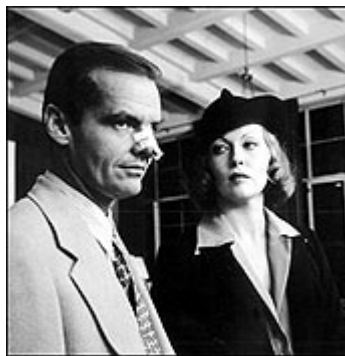
Figure 9 Jake on the prowl with Evelyn Mulwray (Faye Dunaway)

The dialogue also expresses some unusual aspects of characterisation. As the film's parentage can be located both in the classic detective noir of FALCON , directed by Huston and starring Ida Sessions' inspiration and the baddest femme fatale of them all, Mary Astor as Brigid O'Shaughnessy; and THE BIG SLEEP (1946), a film whose convoluted plot so confused its own author, Raymond Chandler, that even he didn't know who had committed one of the murders by the time the film was through. There are clear similarities between the latter and CHINATOWN , with the stifling greenhouse of SLEEP played in opposition to the Oriental gardens of CHINATOWN ; the smouldering rich girl tempted to the bad played by Lauren Bacall posing in ironic counterpoint to the mask-like presence of the tragic Evelyn Mulwray; the wheelchair-bound Sternwood vis-à-vis the omnipotence of Noah Cross; the 'little sister';