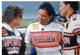
Figure 26 Tom Cruise, Don Simpson and Michael Rooker on the set

Despite Towne's reworking of the genre – Cole collaborates with his competition, he changes tactics in order to win - the script wasn't ready for the shoot, but the studio was “desperate for a summer movie. We knew the script wasn't ready, but we needed a movie for Memorial Day. We needed to work off this tremendous overhead we were paying Don and Jerry. We had a window [of availability] on Tom Cruise. Suddenly we all felt more fondly about the script.” 32 It was scheduled to open opposite DICK TRACY, the new Warren Beatty production. Such were the circumstances in which films were now being made; it was a long time since LAST DETAIL was held back from general release because Columbia worried about shocking its audience and costing the studio its relationship with potential broadcast outlets.