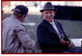
Figure 31 Donald Sutherland as Bill Bowerman

This is how Towne introduces Pre (and the viewer) to Bill Bowerman: