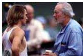
Figure 34 Billy Crudup on set with Robert Towne

It is perhaps ironic that in those films that Towne has directed from his own scripts, his writing technique has been foregrounded: Towne inherited from his close collaborations with the late Hal Ashby a subtle, unobtrusive directing style that allowed actors to shine. This seems to suit Towne's writing, since he disingenuously claims never to have consciously written to a specific style or structure, and allegedly has never actually read a screenplay manual. As already noted, Towne felt that Hal Ashby was the director who most accurately represented the content and tone of his work. Ashby was a great influence in the way that Towne set about bringing his scripts to the screen with himself as director: for both men, it was all about 'tone.'