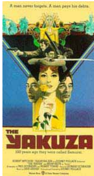
Figure 16 THE YAKUZA poster

the script extract published at the top of Schrader's article is not credited to anyone but is marked with the copyright of Warner Brothers Studio. It is almost exactly a replica of Towne's draft, pages 138 –141. 8