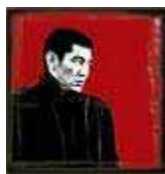
Figure 17 The enigmatic Ken

Ken's supposedly inscrutable character is the emotional pivot to Kilmer's laconic style (virtually pioneered by Robert Mitchum in his cinematic persona): the stinging rebuke