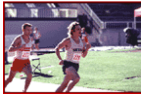
Figure 32 Pre the frontrunner breaks out of the pack

The Aristotelian postulate that character creates action gave rise to its corollary, that action is character. If it's thought of at all in Hollywood, it's usually translated to mean the more action for Arnold, the better... it has always struck me that in movies, far more than in any other dramatic medium, movement , not simply action, is most defining of character. 96