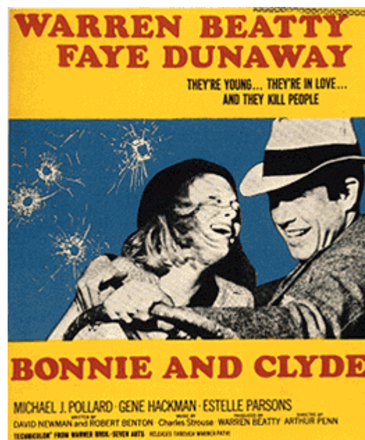
Figure 4 BONNIE AND CLYDE flysheet poster

Newman and Benton were journalists at Esquire magazine in the early 60s when they discovered a mutual love of the films coming out of Europe, especially from France. The newly minted screenwriters were always consciously trying to evoke the mythology inherent in the tale, "... because we saw Bonnie and Clyde as kind of emblematic of the times we were living in. We began to sense that something was going on in this country and that all our values not only culturally but psychologically and mythologically and romantically, that everything was shifting in a really interesting way." 15