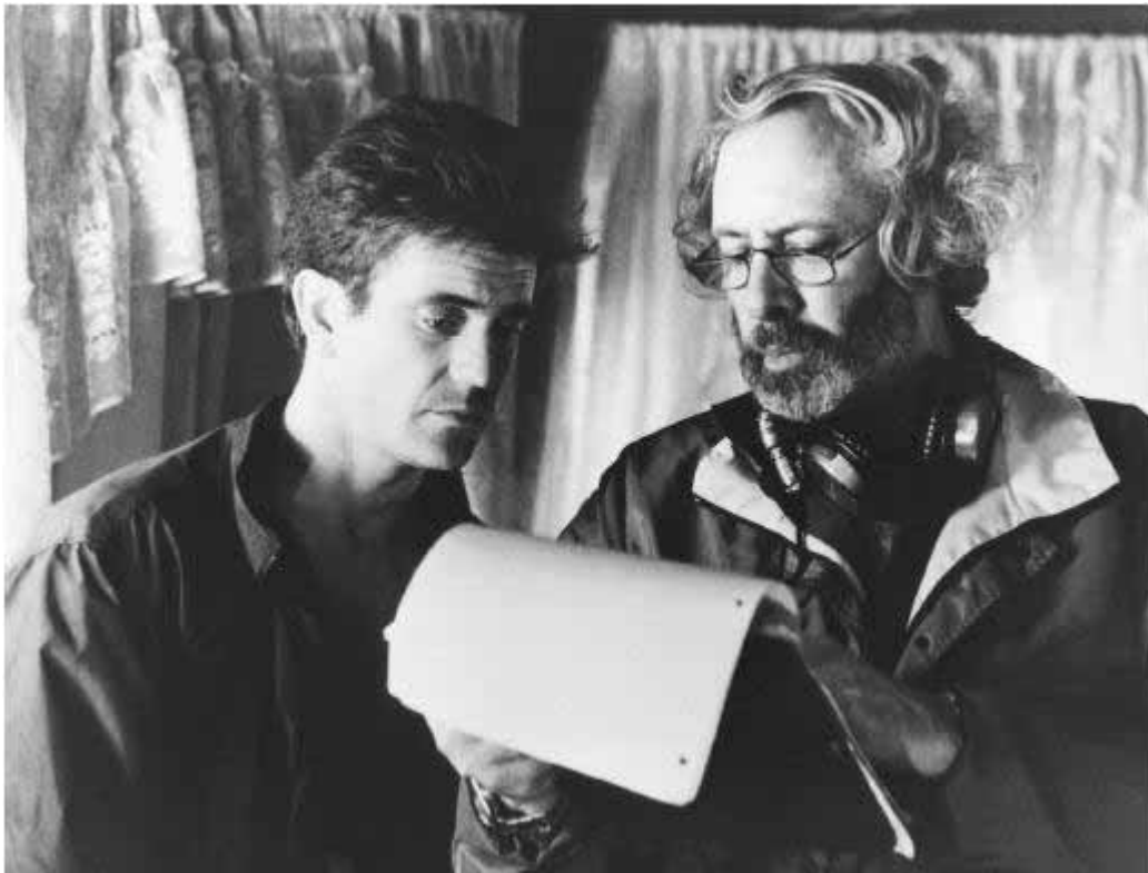
Figure 23 Mel Gibson (Mac) on the set of TEQUILA SUNRISE with Robert Towne

Until he knows it, he is incapable of moving on, of becoming involved with other people, of returning to his true, former self. This need drives Rick within the plot. 122